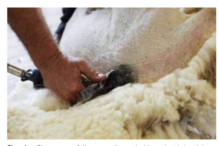
Shearing: Shearers carefully remove the wool with an electric handpiece.

After shearing, wool is processed and made into lots of products we use every day — textiles , clothing and furnishings.