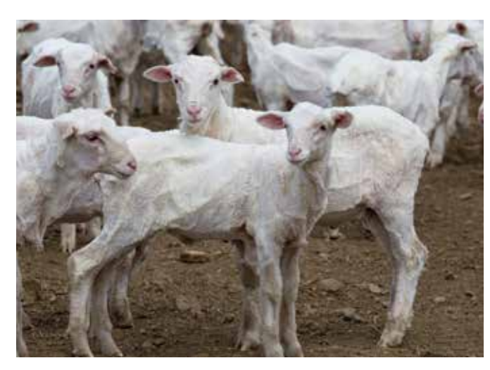
Shearing: After shearing, wool grows back, just like our hair after a haircut.

Wool grows about six millimetres per month, but this varies with the breed of the sheep, nutrition and environment.