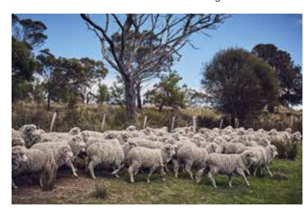
Managing the environment: Woolgrowers manage their sheep and land carefully to protect the animals and the environment.

Woolgrowers in high-rainfall areas have more pasture , so can run more sheep on one hectare of land (a higher stocking rate) than a producer in a low-rainfall area (lower stocking rate).