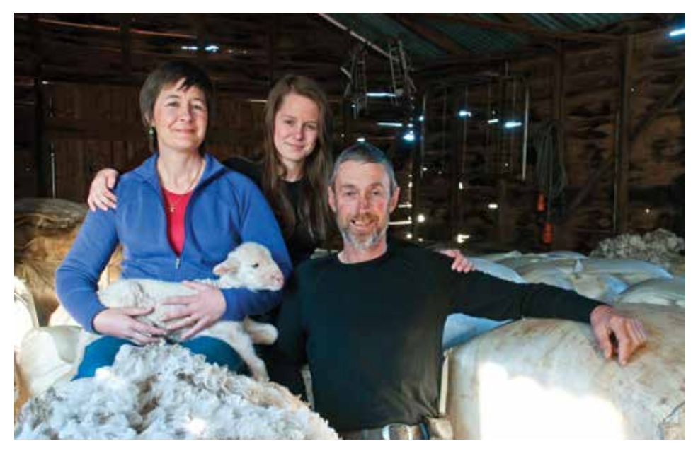
Modern production: Australia's modern wool industry is built on a tradition of family farms, where familes have been producing wool for generations.

Bullocks and carts transported wool from the shearing sheds to the wharves for shipment to Britain, where it was processed and made into clothes and furnishings.